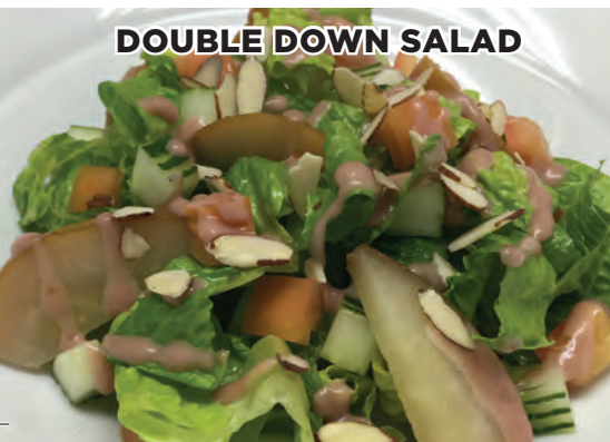
DOUBLE DOWN SALAD